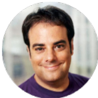
Joel Spolsky Stack Overflow, Trello, Founder