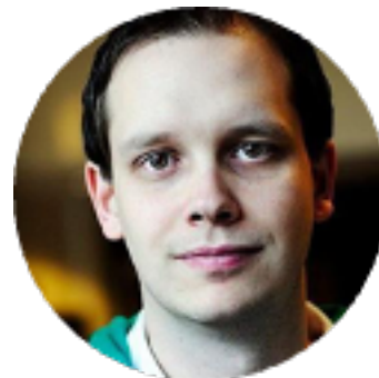
Peter Sunde The Pirate Bay, Co-founder