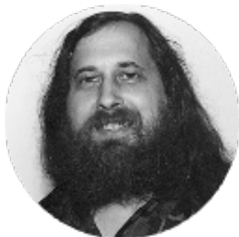
Richard Stallman GNU Project, Founder