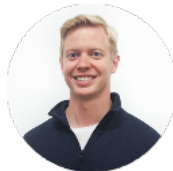
Steve Huffman Reddit, Co-Founder